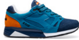
C7095 Lyons Blue/Black Iris