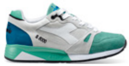
C7079 White/Winter Green