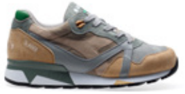
70142 Green Laurel Wreath