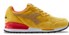
25113 Beige Nugget Gold