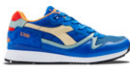
60051 True Blue