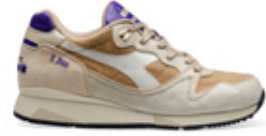
25067 Warm Sand